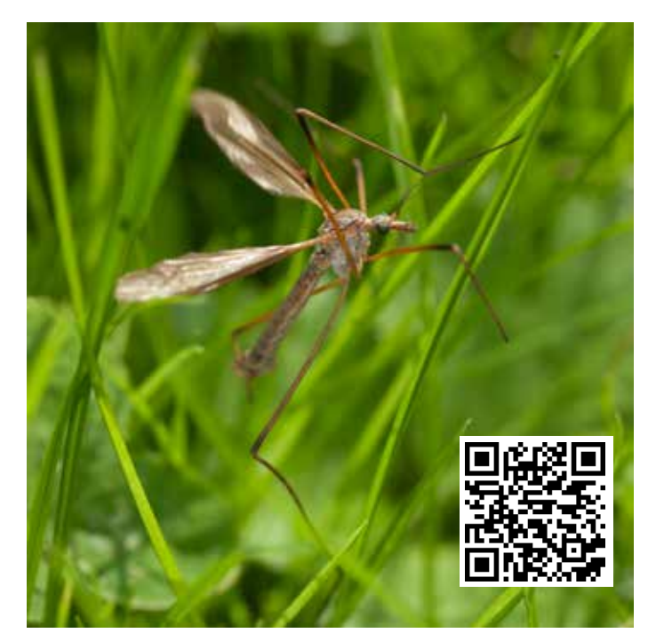
Figure 1: Adult crane fly.

Adult T. paludosa crane flies lay eggs in late summer or early fall. These eggs hatch and become young larvae which feed on the roots and crowns of grass during the rest of the fall, although you may not notice in established forage stands at this time. Mature, well-established grass stands are generally able to survive feeding damage. These larvae overwinter, and in the spring the much bigger larvae continue to feed. It is at this time that new grass plantings are very susceptible to high leatherjacket populations. T. paludosa have one generation per year in the Fraser Valley (Figure 3). Other species, such as T. oleraceae , have two generations per year. This can cause some confusion, as adult crane flies of other species do not necessarily represent a problem. It is not clear how much damage is caused by other species, but we do know for sure that T. paludosa causes significant and "economic" damage.