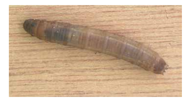
Figure 2: Leatherjacket larva.