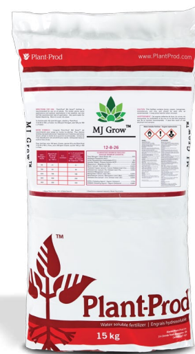
Plant-Prod MJ™ fertilizers are available in 15 kg bags.

Plant-Prod MJ™ Finisher will help with plant finishing when applied at 0.65 g per 1 litre (25 ppm N, 200 ppm P 2 O 5 ). The higher phosphorous and potassium will benefit the plants in their reproductive stage through to finishing. Switch to clear water 14 days before harvest.